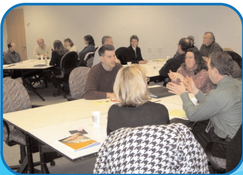
Continue your education at conferences, seminars and workshops...

Networking. Young Professionals know how to have fun. The committee holds special events during the year and hosts special activities during the Annual Conference, so you know you'll be surrounded by people your age.