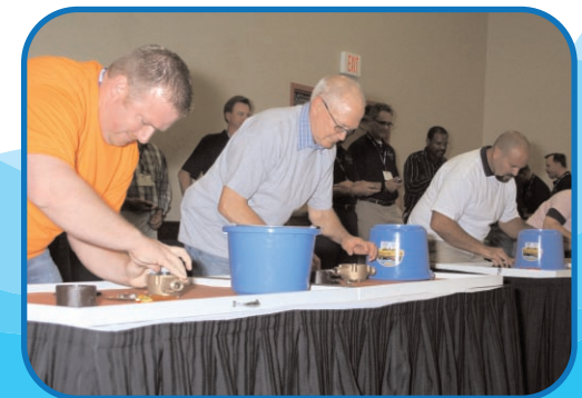
...and don't forget to have a little fun!